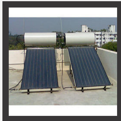
Solar Water Heating System