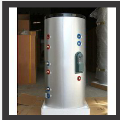
Solar Water Heater Tank