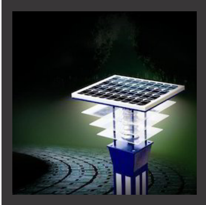
Outdoor Solar Light