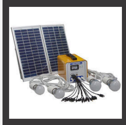
Solar Lighting System