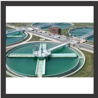
Effluent Water Treatment Plant