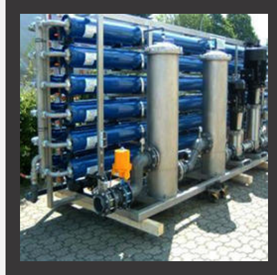
Reverse Osmosis Water Treatment Plant