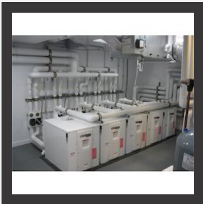
Heat Pump Systems