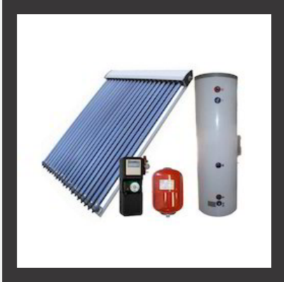
Solar Water System