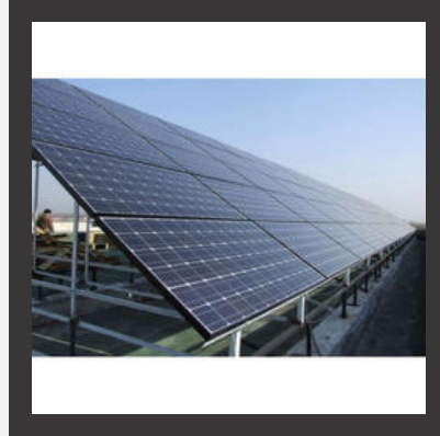
Solar Photovoltaic Systems