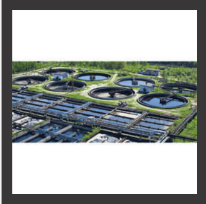
Water Treatment Plants