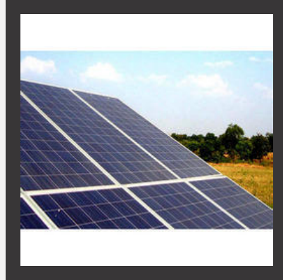
Industrial Water Heating System