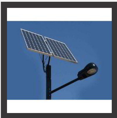
Solar Street Lighting System