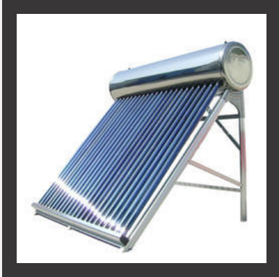
Solar Water Heater