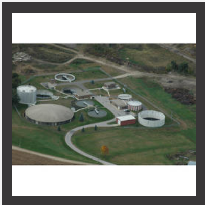
Wastewater Treatment Plant