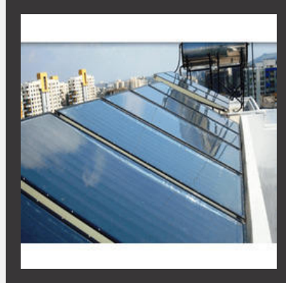
FPC Solar Water Heater