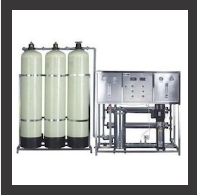
Water Filtration Plant