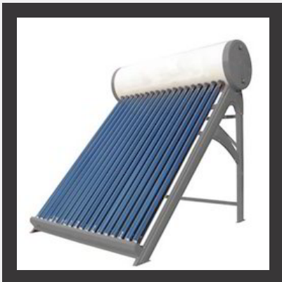
Solar Hot Water Heater